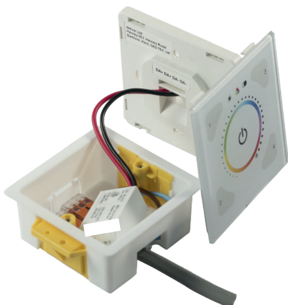
Compact DALI Power Supply in a back box, connected to an ILLUSTRIS panel.